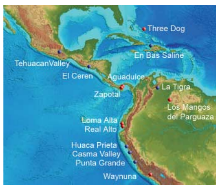
Fig. 1. Archaeological sites mentioned in the text. Red sites yielded starch grains of chili pepper. Blue sites yielded all other classes of remains of chili pepper.