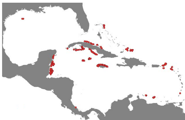
Figure 1. Map of the Caribbean indicating the locations sampled. Filled circles, sampled sites.

methodology to sample the status of different coral reef guilds all throughout the Caribbean ( www.agraa.org ). In this paper, we used the surveys carried out in the shortest interval of consecutive years that had the largest number of locations sampled to avoid temporal variations in the guilds while increasing sampling size. In the light of this condition, our analysis has to be interpreted as a snapshot of the potential drivers of coral reef change. The surveys used were those carried out between 1999 and 2001. Those surveys were located in 322 reef sites belonging to 13 countries of the Caribbean (figure 1). The sampling comprises the broad variety of sites that may be found in the region like coastal, island and oceanic reefs with varying degrees of human densities and exposure to environmental factors. Such a sampling is likely to maximize statistical variation, and therefore provides a good proxy to assess the general causes of coral reef change in the Caribbean. We only used data from the sites located in the forereef to have a standard comparison among sites. We also included species richness in the analyses to assess potential variations in community structure along gradients of coral reef diversity. For each coral reef community, we quantified the biomass of carnivorous and herbivorous fishes, coral mortality and the abundance of macroalgae and Diadema antillarum (see extended details in the electronic supplementary material).