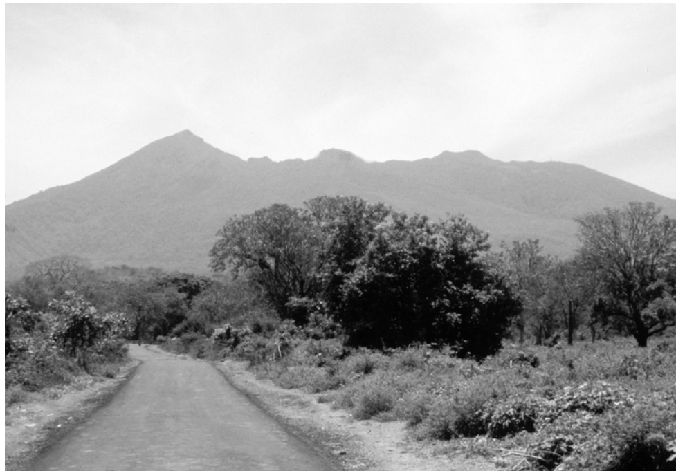
Figure 4. Mombacho Volcano Nature Reserve and surrounding area.