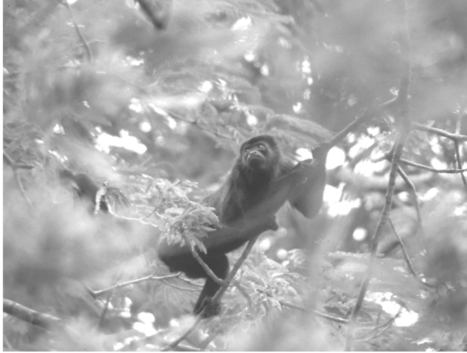
Figure 2. Adult female mantled howler monkey ( A. palliata ), in a shade coffee plantation in Mombacho Volcano, Nicaragua.

species (Marsh, 1999). Such flexibility may explain the ability of howlers to colonize many habitats: they have been found in primary and regenerating rainforest, dry deciduous, riparian, coastal lowland, mangrove, and cloud forests (Wolfheim, 1983). Howlers of all species will occupy marginal areas when necessary (e.g., Baldwin and Baldwin, 1972; Schwarzkoph and Rylands, 1989; Limeira, 1997), including areas of shade coffee cultivation (Estrada and Coates-Estrada, 1996; Garber et al., 1999). Nevertheless, they demonstrate a marked preference for primary and riparian habitats, presumably due to a higher density of food species (Glander, 1978; Stoner, 1993).