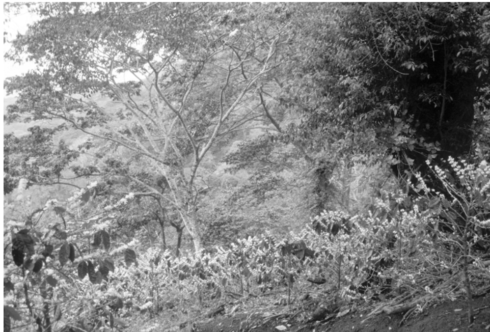
Figure 1. Monocultural sun coffee plantation (top foreground) in comparison to a traditional rustic shade coffee plantation (bottom) in Nicaragua.